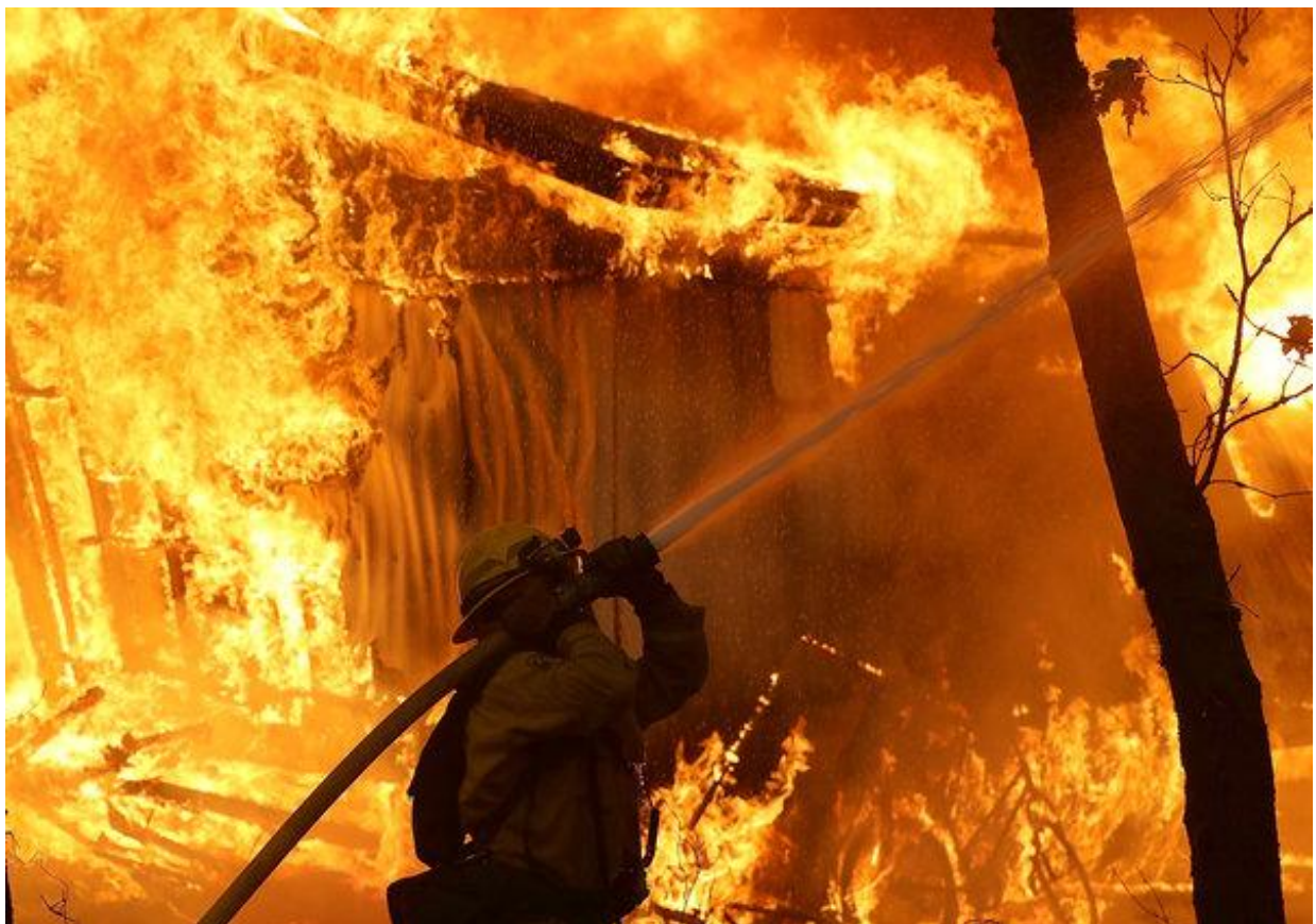
Fighting the Camp Fire this month in Magalia, Calif.

But the new report also emphasizes that the outcomes depend on how swiftly and decisively the United States and other countries take action to mitigate global warming. The authors put forth three main solutions: putting a price on greenhouse gas emissions, which usually means imposing taxes or fees on companies that release carbon dioxide into the atmosphere; establishing government regulations on how much greenhouse pollution can be emitted; and spending public money on clean-energy research.