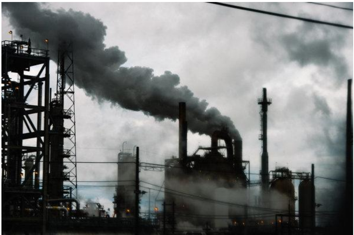
An oil refinery in Port Arthur, Tex. President Trump has pushed to roll back regulations on carbon emissions.

But in 2016, Republicans in general and Mr. Trump in particular campaigned against those regulations. In rallies before cheering coal miners, Mr. Trump vowed to end what he called Mr. Obama's "war on coal" and to withdraw from the Paris deal. Since winning the election, his administration has moved decisively to roll back environmental regulations.