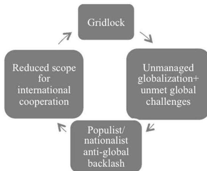
Figure 1: The vicious cycle of self-reinforcing gridlock

Today, however, gridlock has set in motion a self-reinforcing element, which contributes to the crises of our time in new and distinct ways (see Hale and Held et al, 2017, pp. 252 – 57). There are four stages to this process: see figure 1.